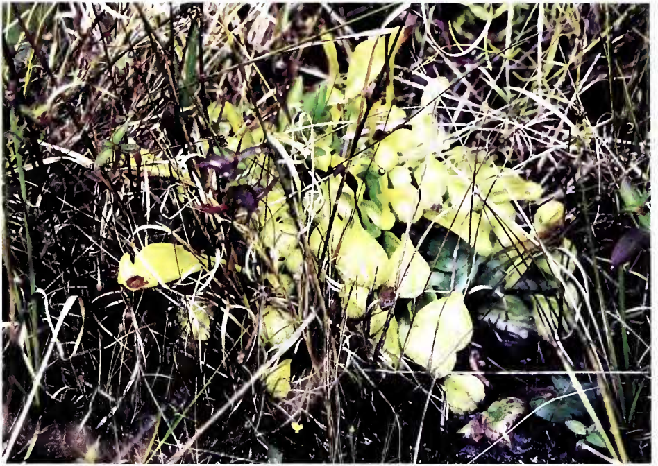
Figure 7: Sarracenia 'Green Rosette'